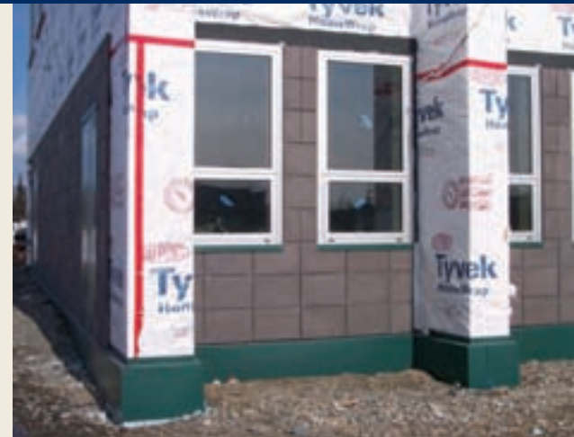
Battalion Headquarters Building FORT WAINWRIGHT Fairbanks, Alaska

Castia Stone was selected to clad the Battalion Headquarters Building at Fort Wainwright in Fairbanks, Alaska. From a cold weather test station to one of the Army's premier training areas, Fort Wainwright has come a long way. As a site once used for testing cold weather clothing and equipment in the bitter cold winters, this Fort required something that would stand up to the elements. Castia Stone has many features that make it optimal for installing in harsh climates like Fairbanks, Alaska as well as all other climatic areas of the world.